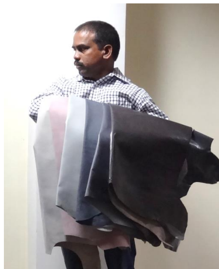
Colours of EARLY DAWN