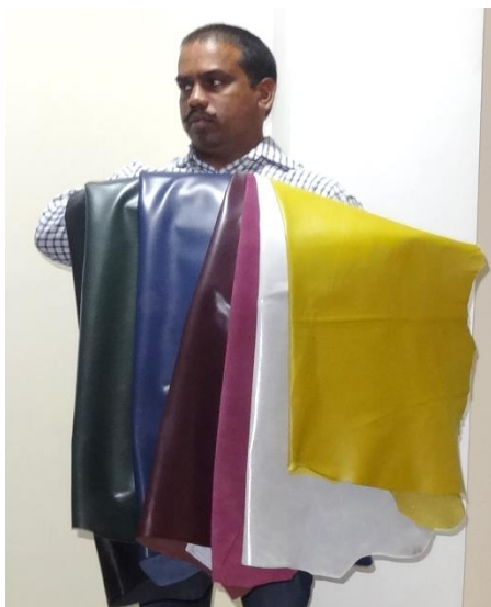
Colours of MIDNIGHT

He informed the gathering about the proceedings of the MODEUROP Colour Club Meeting for the Autumn Winter 2015/16 season in Spreitenbach, Switzerland and focussed on the Trend Presentations made at that meeting. He quickly traced the Colour Inspirations for the season as being "Ready for a new day" and explained that the new day starts in the middle of the night with Light and colour belong together, because nothing changes the perception and character of colours more than the fluctuation and intensity of light. He added that the gloomy and dark shades of the night, illuminated only by stars or flashes of lightning, morph into hazy and elusive nuances at the break of dawn, then erupt into bright and warm colourfulness thanks to the intense rays of the sun during the day. These changes in lighting and colour intensity are what inspired the MODEUROP team in the design of the new Colour Card Autumn/Winter 15/16, and so the new titles of the new Colour Stories were: Midnight – Early Dawn – High Noon , he elucidated.